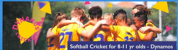
Softball Cricket for 8-11 yr olds - Dynamos