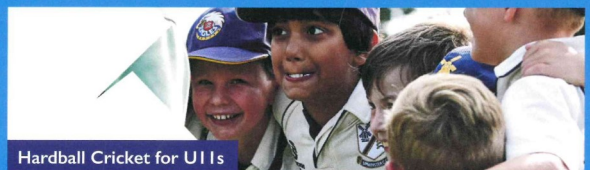
Hardball Cricket for U11s