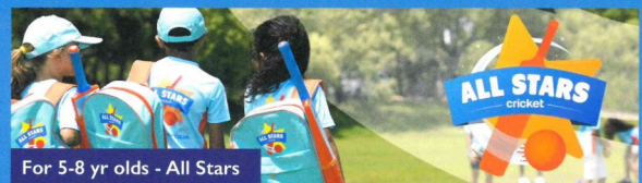
For 5-8 yr olds - All Stars

Thirsk CC is delighted to announce its junior cricket coaching programmes for 2021