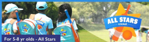
For 5-8 yr olds - All Stars

Thirsk CC is delighted to announce its junior cricket coaching programmes for 2021