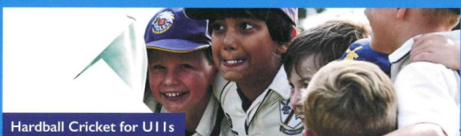
Hardball Cricket for U11s