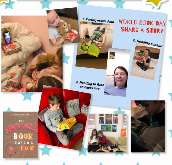
World Book Day Reading Star Competition