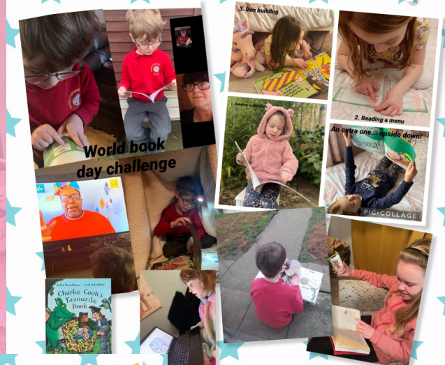
World Book Day Reading Star Competition