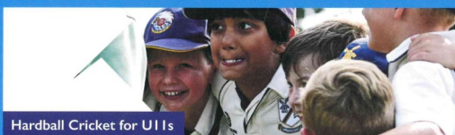
Hardball Cricket for U11s