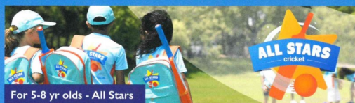
For 5-8 yr olds - All Stars

Thirsk CC is delighted to announce its junior cricket coaching programmes for 2021