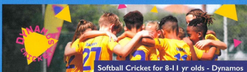
Softball Cricket for 8-11 yr olds - Dynamos