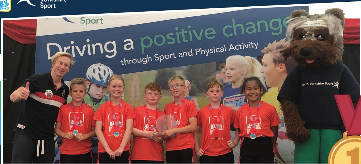
Hockey Year 3/4 - Thirsk Community Primary School